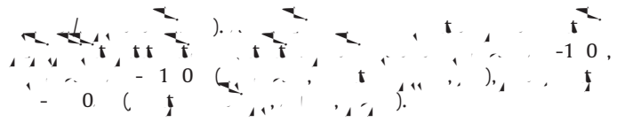
Test method development and validation